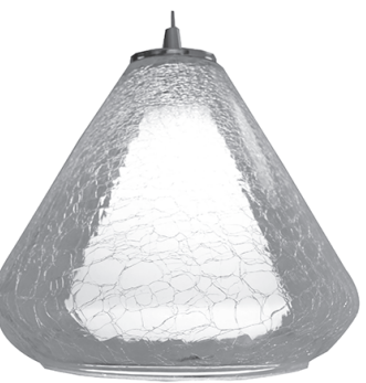
CC Clear Crackle