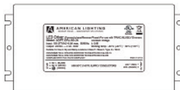
Adaptive 192W Power Supply