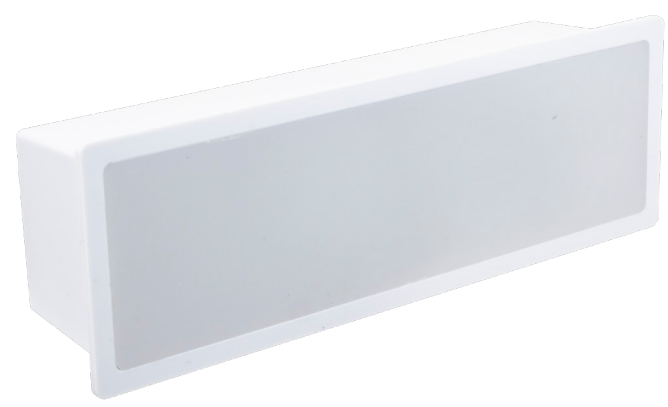
BRICK LIGHT LED MODULE