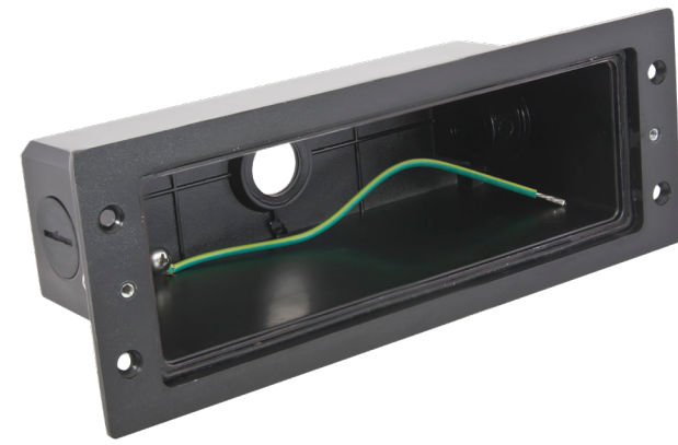
BRICK LIGHT ROUGH-IN HOUSING