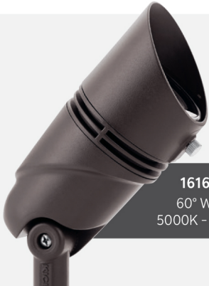
16162AZT50 60° Wide Flood 5000K - Bright White