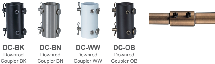
DC-BK Downrod Coupler BK DC-BN Downrod Coupler BN DC-WW Downrod Coupler WW DC-OB Downrod Coupler OB